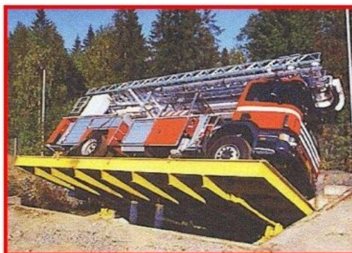
Rigorous testing to the highest international standards