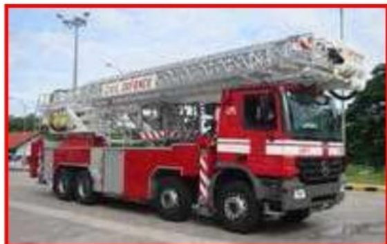
SF-550 on Mercedes Actros chassis with custom fire engineering bodywork and fixed pump installation

Large high strength stainless steel cage with 4 doors and space to enter wheelchair, water monitor and water hose connection(s)