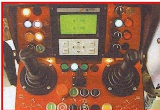
Full control of all cage movements and machine functions. User-friendly and easy to operate.