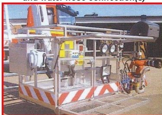
Superb cage access at ground level with fold-down front platform for stretcher & wheelchair rescue with room for 5 adults